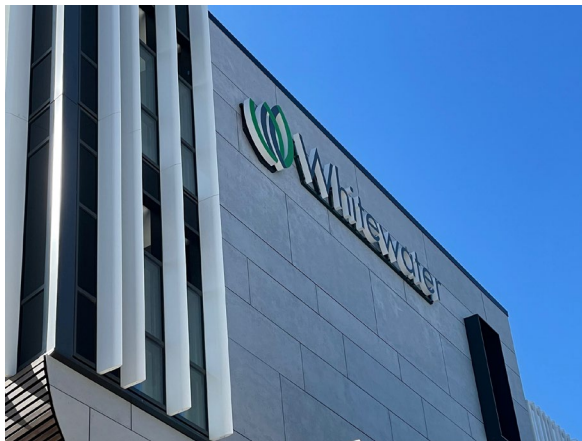
TLC Whitewater aged care's newly-installed exterior signage