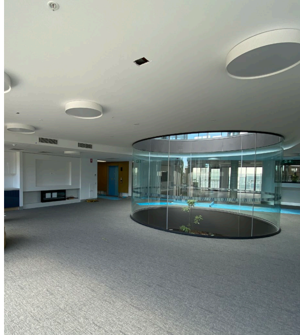
Feature planted glass atrium in Whitewater aged care lounge area

TLC Healthcare (TLC) is set to launch Australia's first multi-generational healthcare precinct, in less than a month. Located in beautiful bayside Mordialloc, this is the first time all service areas in which TLC operates are co-located at one site, bringing much-needed integrated healthcare services to the local community.